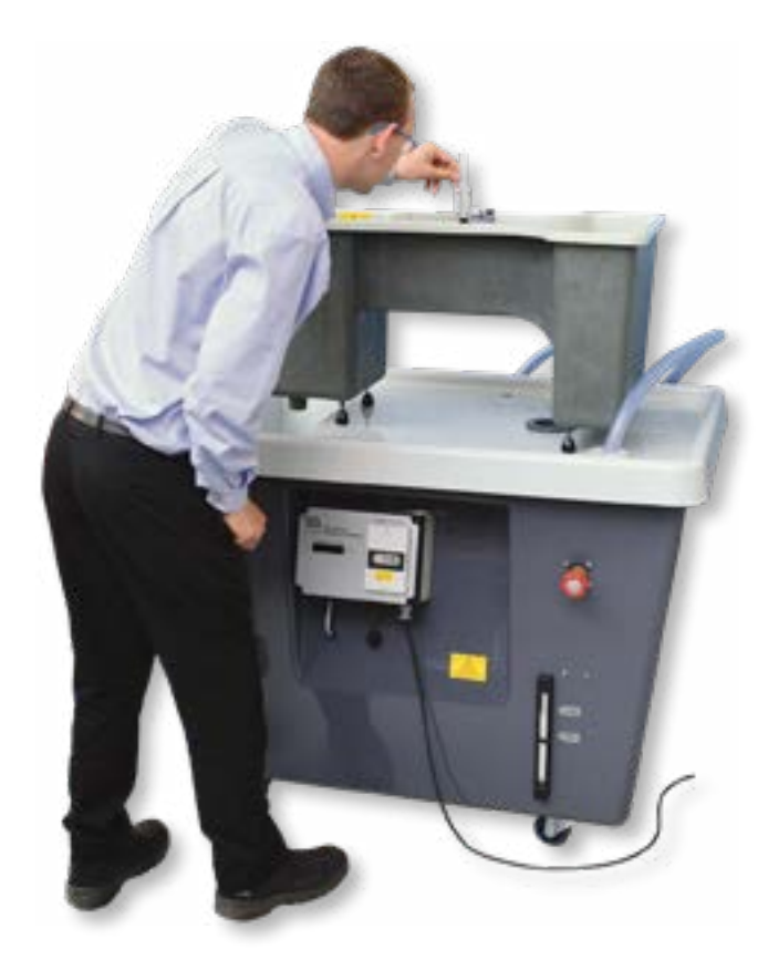
SHOWN WITH THE DIGITAL HYDRAULIC BENCH (HIF, AVAILABLE SEPARATELY)

80% at temperatures < 31°C decreasing linearly to 50% at 40°C