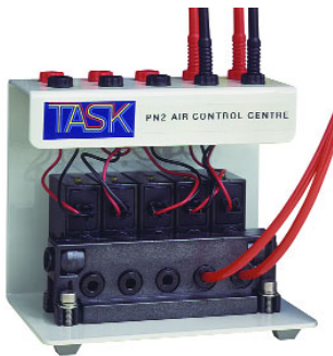
The optional Air Control Centre (PN2)

A unit with a common manifold input and five separate outputs, each with an electrically operated (solenoid) air valve. A DC voltage applied to a valve opens it, to allow compressed air to pass through. Can work directly with a Programmable Logic Controller, or with the Contact Controller (DCH1) for computer control.