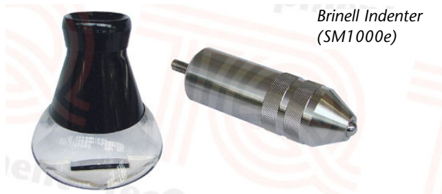
Brinell Indenter (SM1000e)