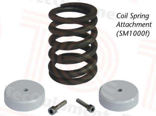
Coil Spring Attachment (SM1000f)