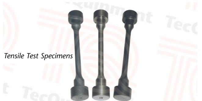
Tensile Test Specimens