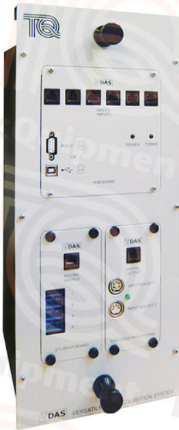
Versatile Data Acquisition System Frame-mounting Interface (VDAS-F)