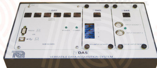
Versatile Data Acquisition System Bench-top Interface (VDAS-B)