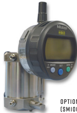
OPTIONAL EXTENSOMETER (SM1000D)