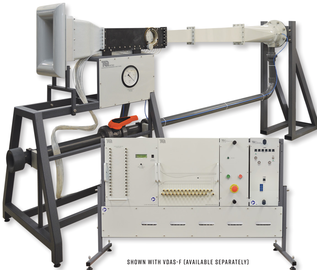
SHOWN WITH VDAS-F (AVAILABLE SEPARATELY)