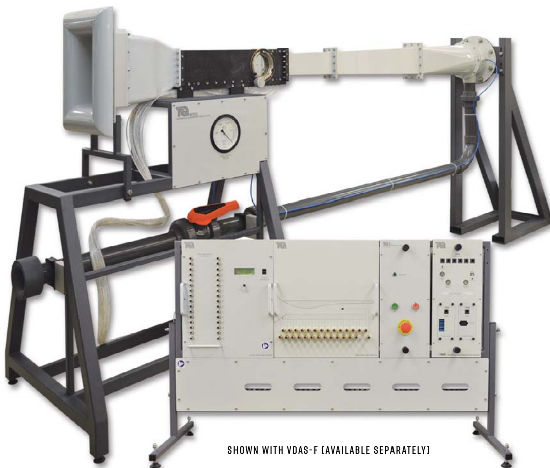
SHOWN WITH VDAS-F (AVAILABLE SEPARATELY)