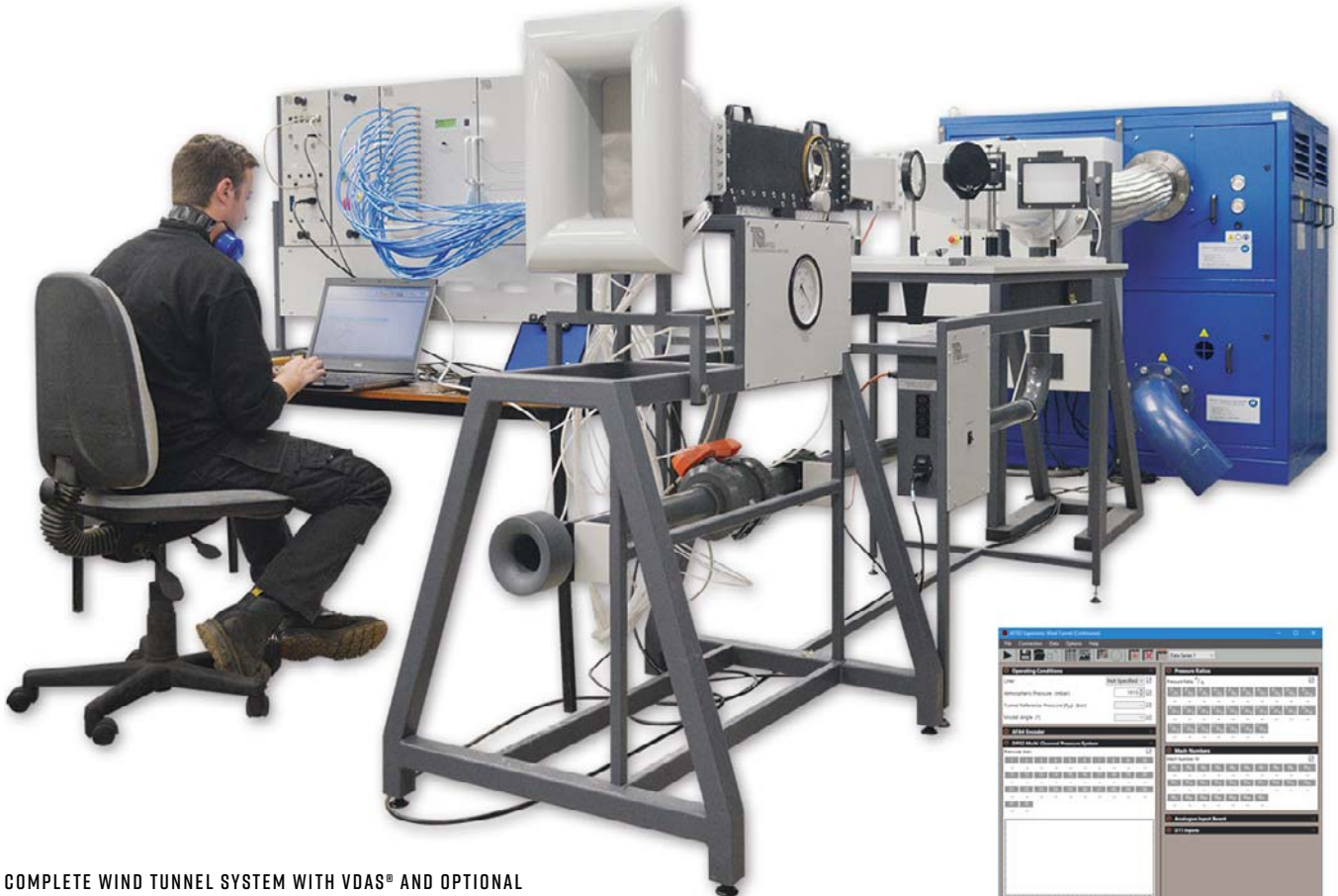
COMPLETE WIND TUNNEL SYSTEM WITH VDAS® AND OPTIONAL AF302A SCHLIEREN APPARATUS (BOTH AVAILABLE SEPARATELY)