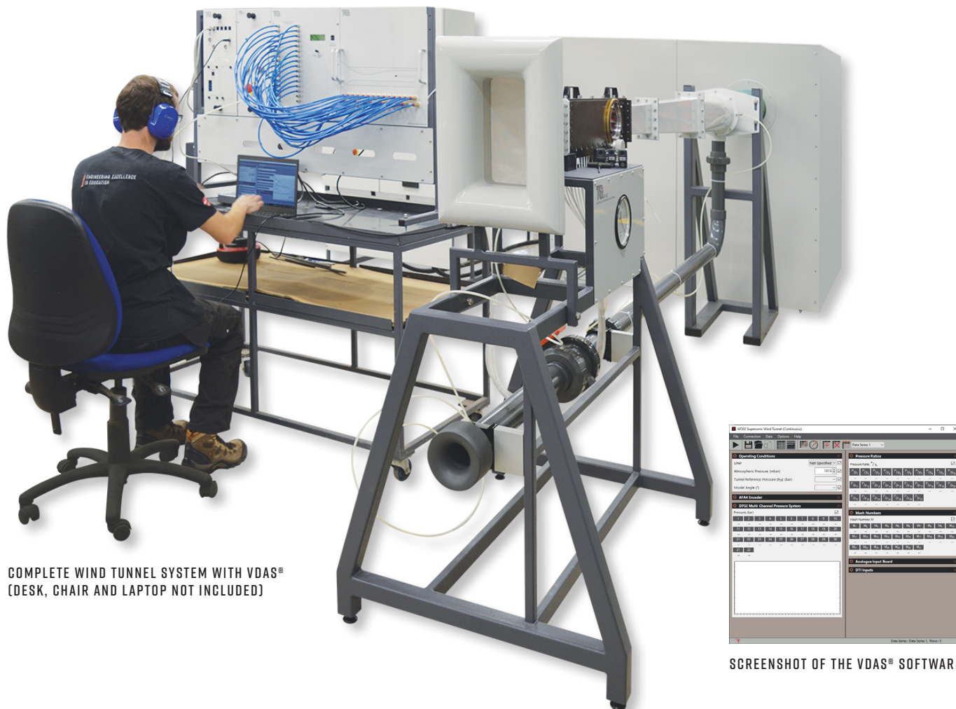
COMPLETE WIND TUNNEL SYSTEM WITH V DAS® (DESK, CHAIR AND LAPTOP NOT INCLUDED)

A suction-type, continuous-operation supersonic (up to Mach 1.8) wind tunnel for investigations into subsonic and supersonic air flow around two-dimensional models. Also for analysis of the profile of the tunnel working section.