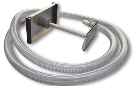
SEDIMENT DISCHARGE UNIT AND SEDIMENT TUBE