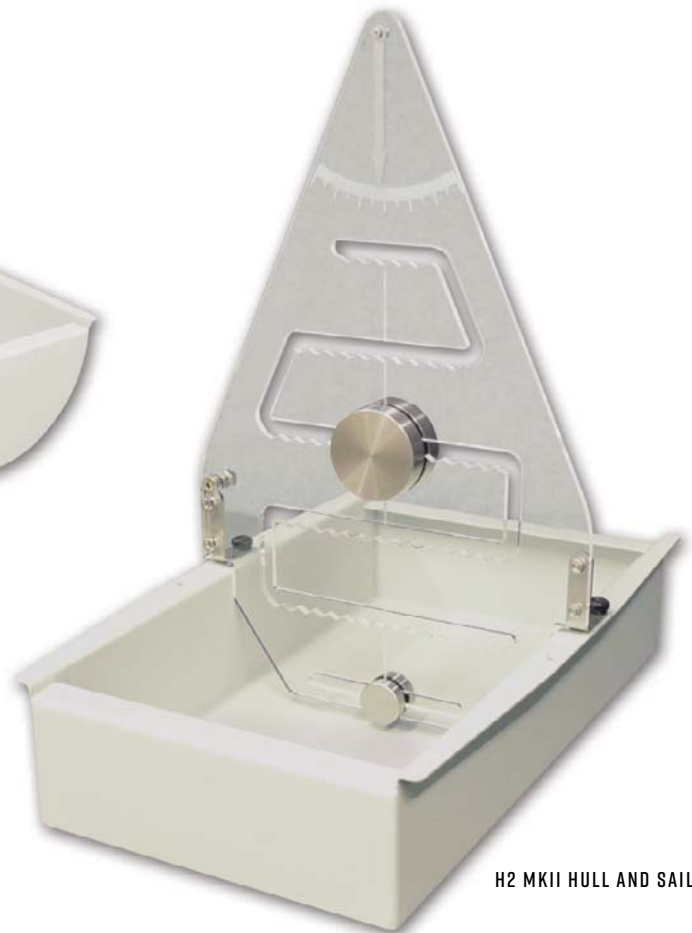
H2 MKII HULL AND SAIL