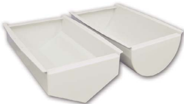
OPTIONAL VEE (HARD) CHINE AND HALF ROUND (ROUND BILGE) HULLS (H2A MKII)

A benchtop apparatus to determine the stability of a pontoon with its centre of gravity, metacentric height and metacentre at various heights.