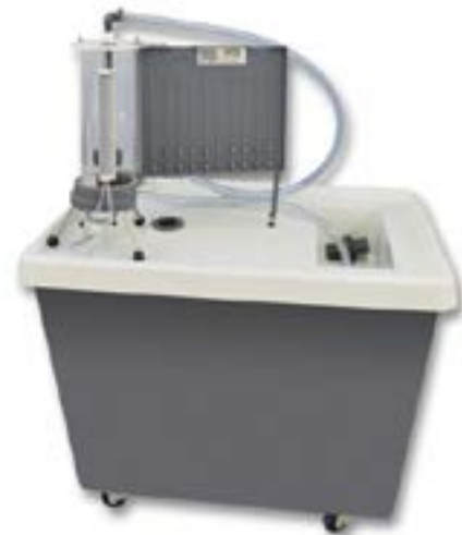
SHOWN WITH TEC-EQUIPMENT'S HYDRAULIC BENCH (H1F, NOT INCLUDED)

*This product will also work with an existing TecEquipment Volumetric Hydraulic Bench (H1D)