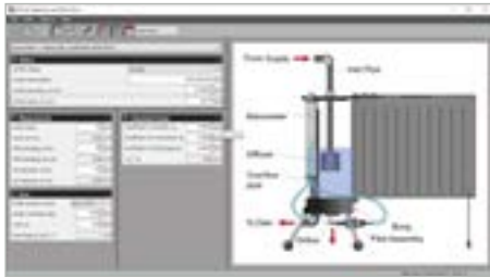
SCREENSHOT OF THE HDMS SOFTWARE

A constant head device, backboard, set of nozzles and Pitot tube. This apparatus demonstrates vertical flow and horizontal jet trajectories through different orifices (nozzles) and allows students to study the trajectory profiles of water jets from the nozzles when mounted horizontally.