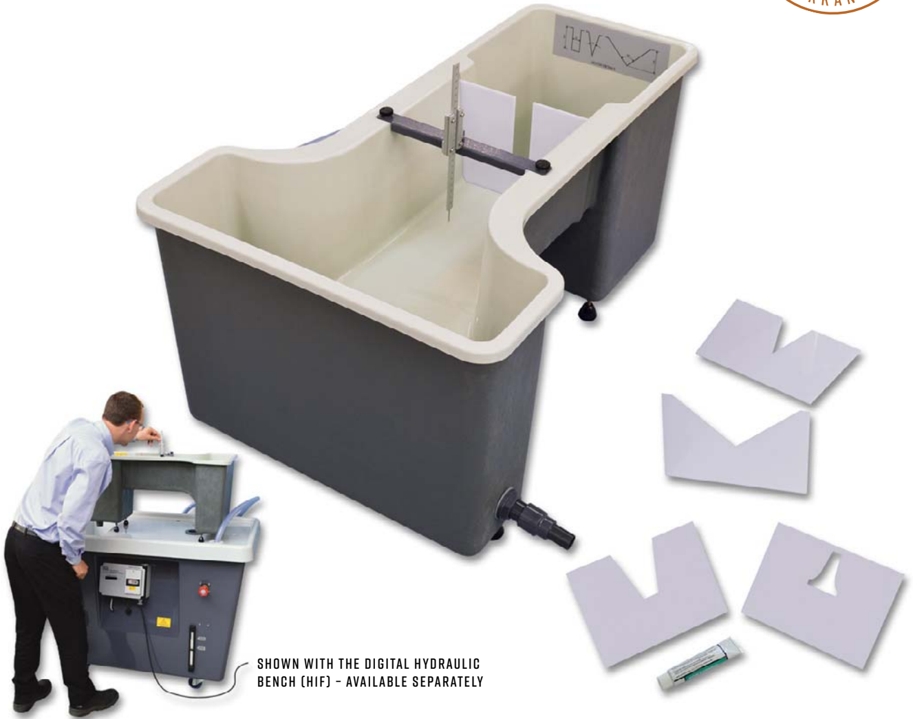
SHOWN WITH THE DIGITAL HYDRAULIC BENCH (HIF) - AVAILABLE SEPARATELY