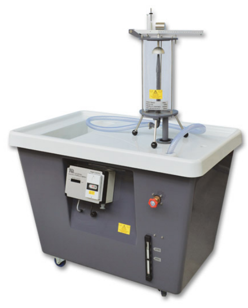
SHOWN MOUNTED ON THE DIGITAL HYDRAULIC BENCH (HIF) - AVAILABLE SEPARATELY