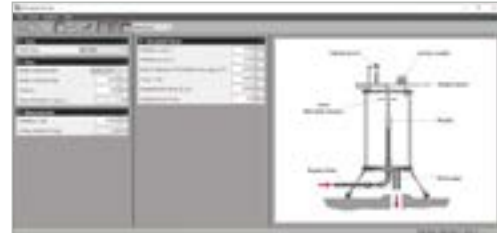
SCREENSHOT OF THE HDMS SOFTWARE