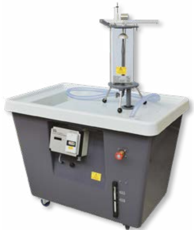
SHOWN MOUNTED ON THE DIGITAL HYDRAULIC BENCH (HIF) - AVAILABLE SEPARATELY

80% at temperatures < 31°C decreasing linearly to 50% at 40°C