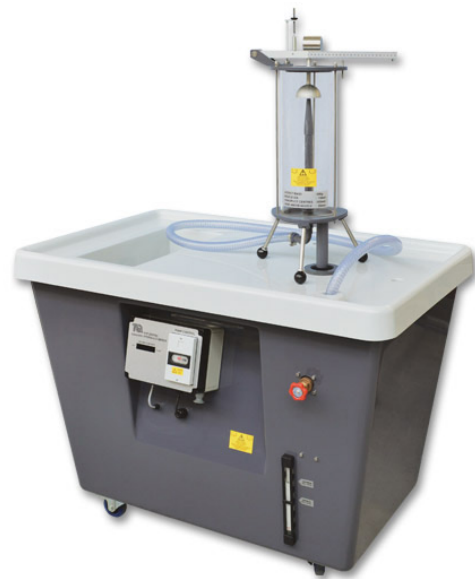
SHOWN MOUNTED ON THE DIGITAL HYDRAULIC BENCH (H1F) - AVAILABLE SEPARATELY