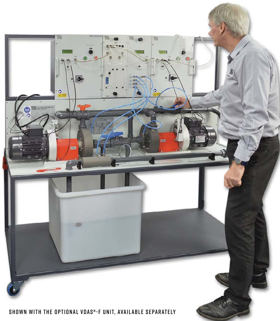
SHOWN WITH THE OPTIONAL VDAS®-F UNIT, AVAILABLE SEPARATELY