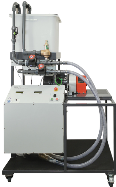
THE BASE UNIT (H85V) SHOWN WITHOUT A PUMP FITTED