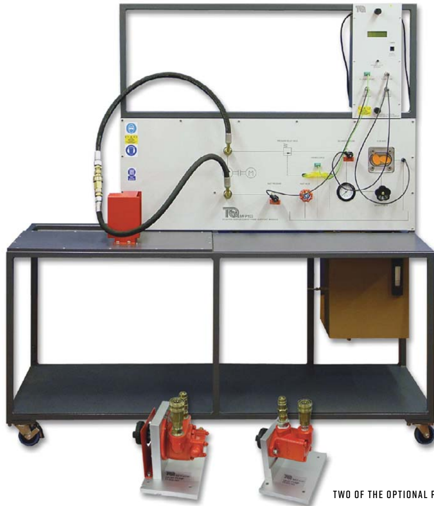
TWO OF THE OPTIONAL PUMPS