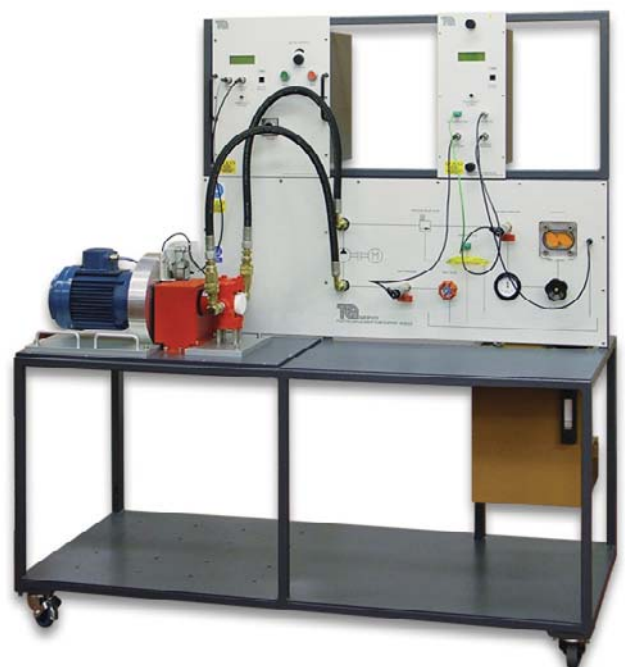
SHOWN FITTED WITH THE UNIVERSAL DYNAMOMETER (MFP100) AND A PUMP