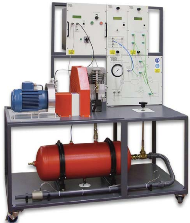
SHOWN FITTED WITH THE UNIVERSAL DYNAMOMETER