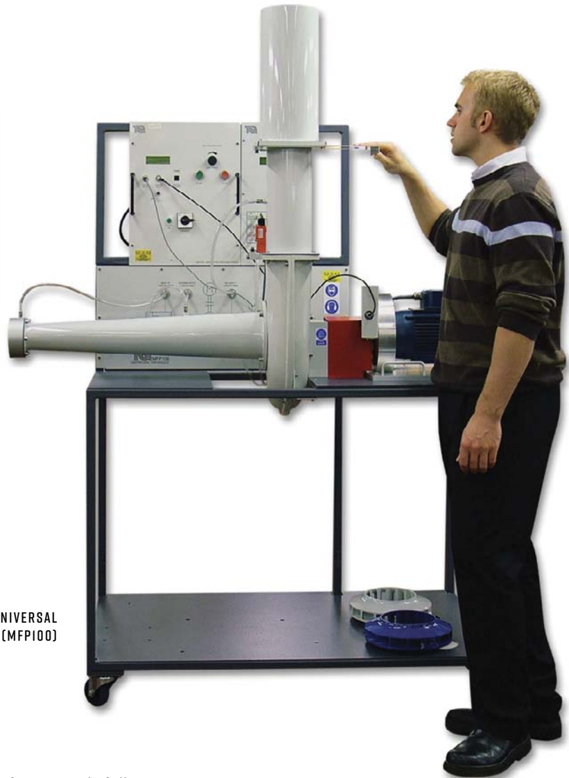
SHOWN FITTED WITH THE UNIVERSAL DYNAMOMETER (MFP100)