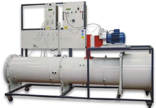
SHOWN FITTED WITH THE UNIVERSAL DYNAMOMETER (MFP100)

This gives a recommended minimum floor space of 8.3 m x 3.06 m.