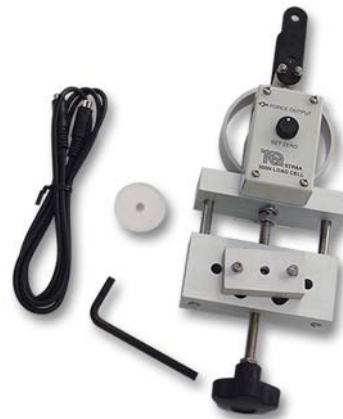
ADDITIONAL LOAD CELL (STR8A)