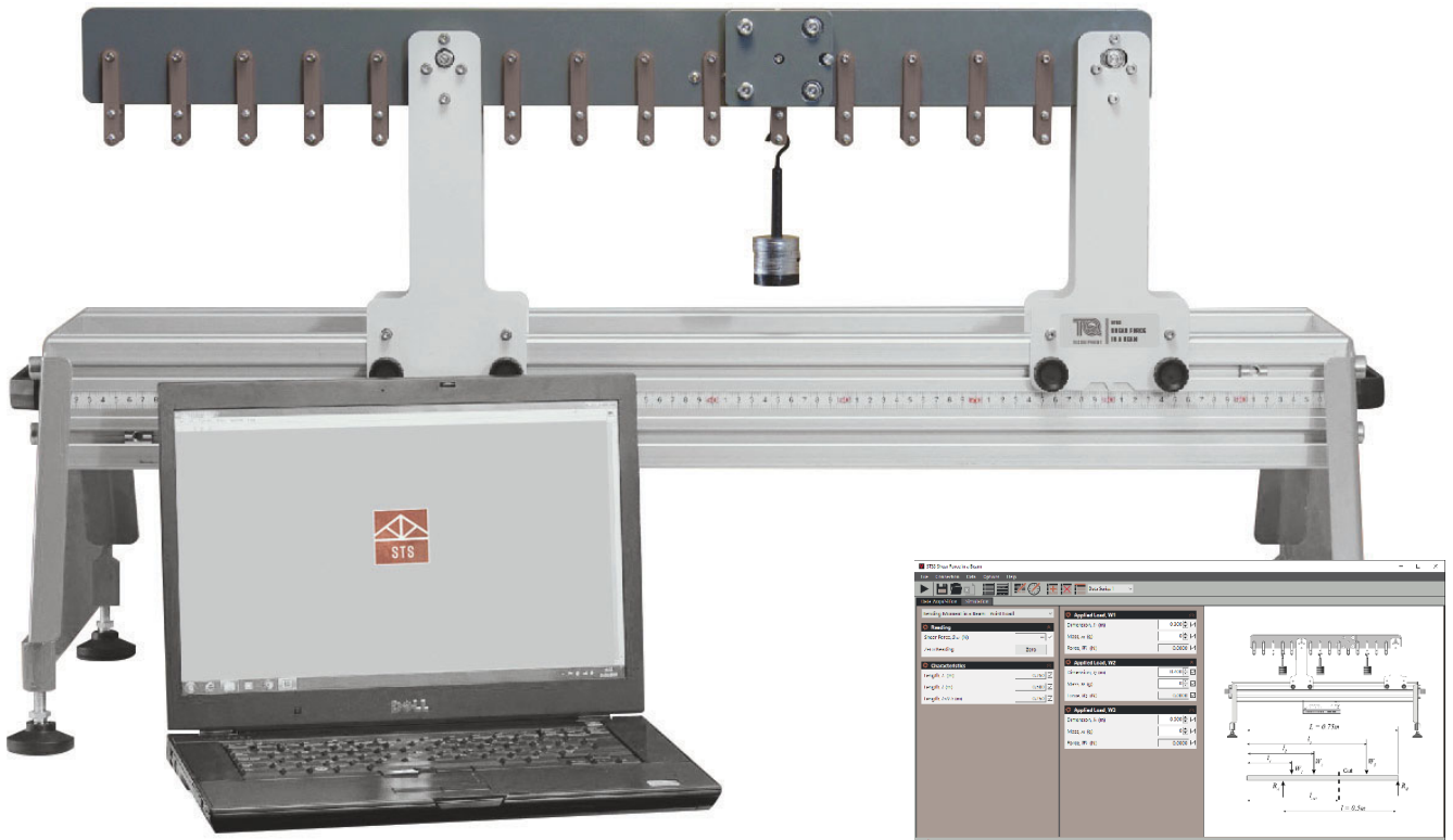
SHOWN FITTED TO THE STRUCTURES PLATFORM (STS1, AVAILABLE SEPARATELY) LAPTOP NOT INCLUDED

Experiment that illustrates and proves the basic theory of shear force in a beam. Mounts on the Structures platform and connects to the Structures automatic data acquisition unit and software (VDAS® Onboard).