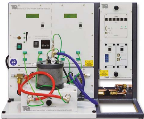
SHOWN FITTED WITH ONE OF THE OPTIONAL HEAT EXCHANGER MODULES (TD360D) AND OPTIONAL VDAS-F INTERFACE

You can do tests with or without a computer connected. However, for quicker tests with easier recording of results, TecQuipment can supply the optional Versatile Data Acquisition System (VDAS ® ). This gives accurate real-time data capture, monitoring and display, calculation and charting of all the important readings on a computer (computer not included).