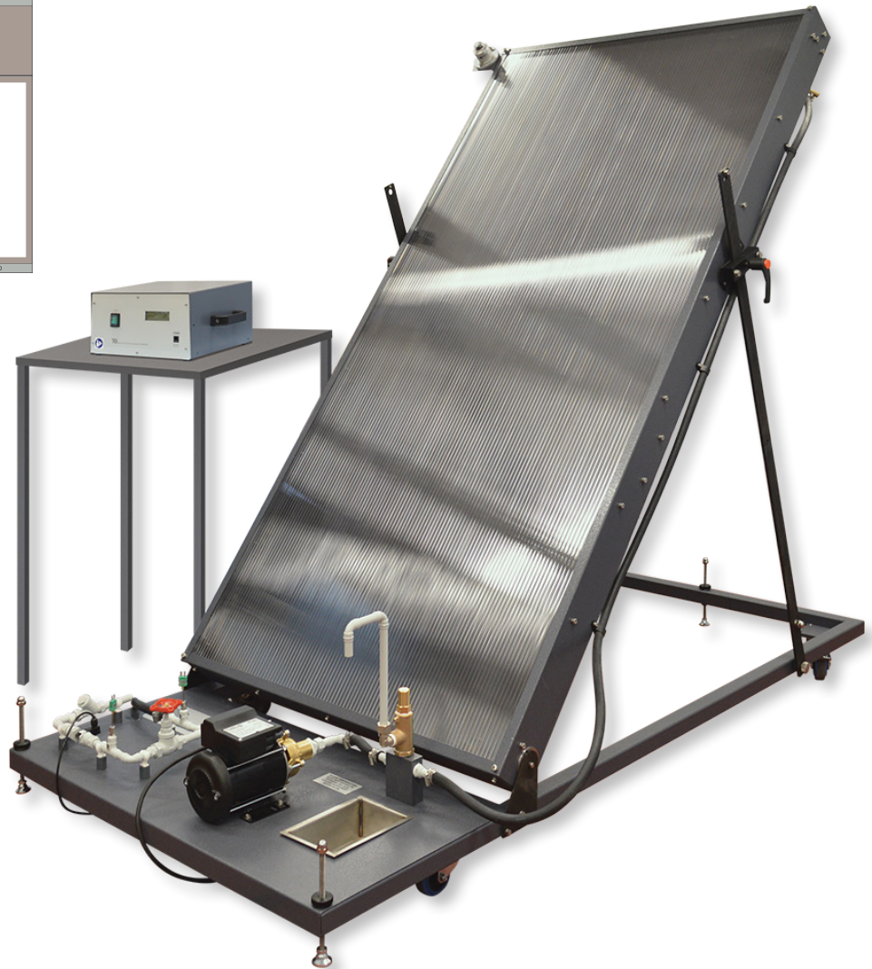
TABLE NOT INCLUDED