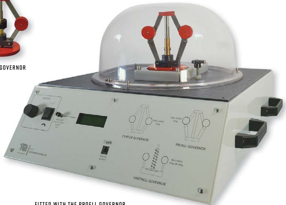
FITTED WITH THE PROELL GOVERNOR