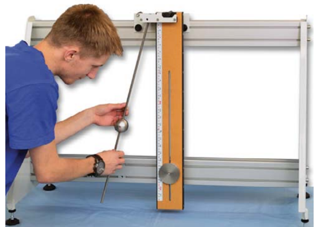
SHOWN WITH THE TEST FRAME (TM160)