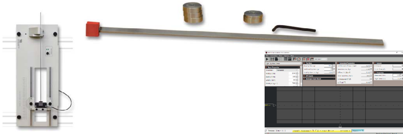
[BEAM VERTICALLY MOUNTED]